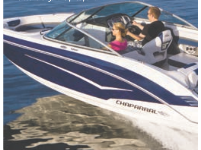
ALL PHOTOS PROVIDED

High-class meets comfort and family fun with the new 20-foot VRX. It comes in six eye-catching colors with a premium sound system, hand-stitched cockpit finishing and snap-in carpet. The oversized platform provides the perfect launch pad for water sports. And a high-output powertrain services the most advanced dashboard electronics you'll find at this length and price point.