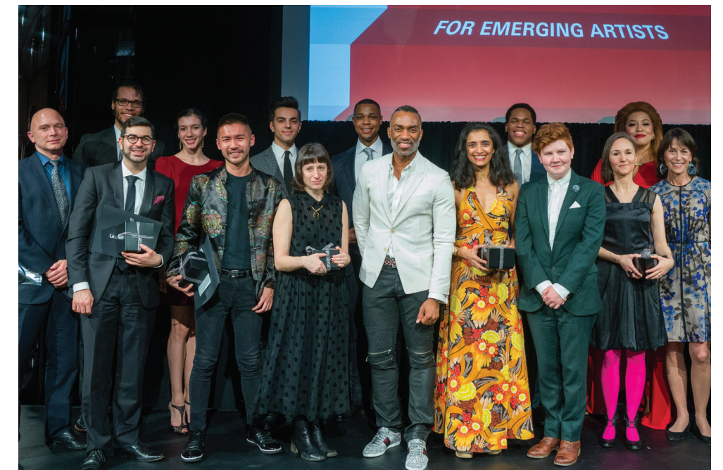
2018 Lincoln Center Awards recipients and award presenters

Lincoln Center is committed to supporting these artists as they continue to personally hone their crafts, pursue professional success, and elevate their art forms to all new heights—ensuring a richer future for the performing arts, for everyone.